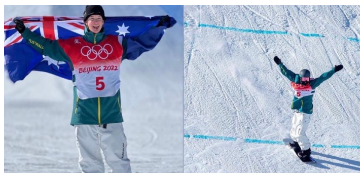
Picture of Tess Coady