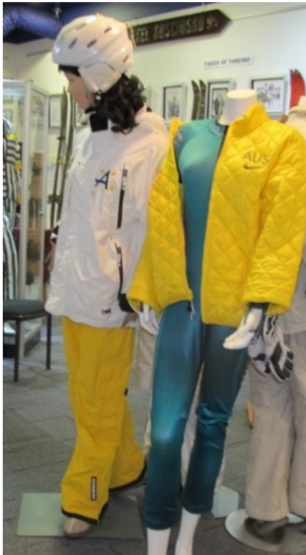
Olympic Games Uniforms - donated by our locals